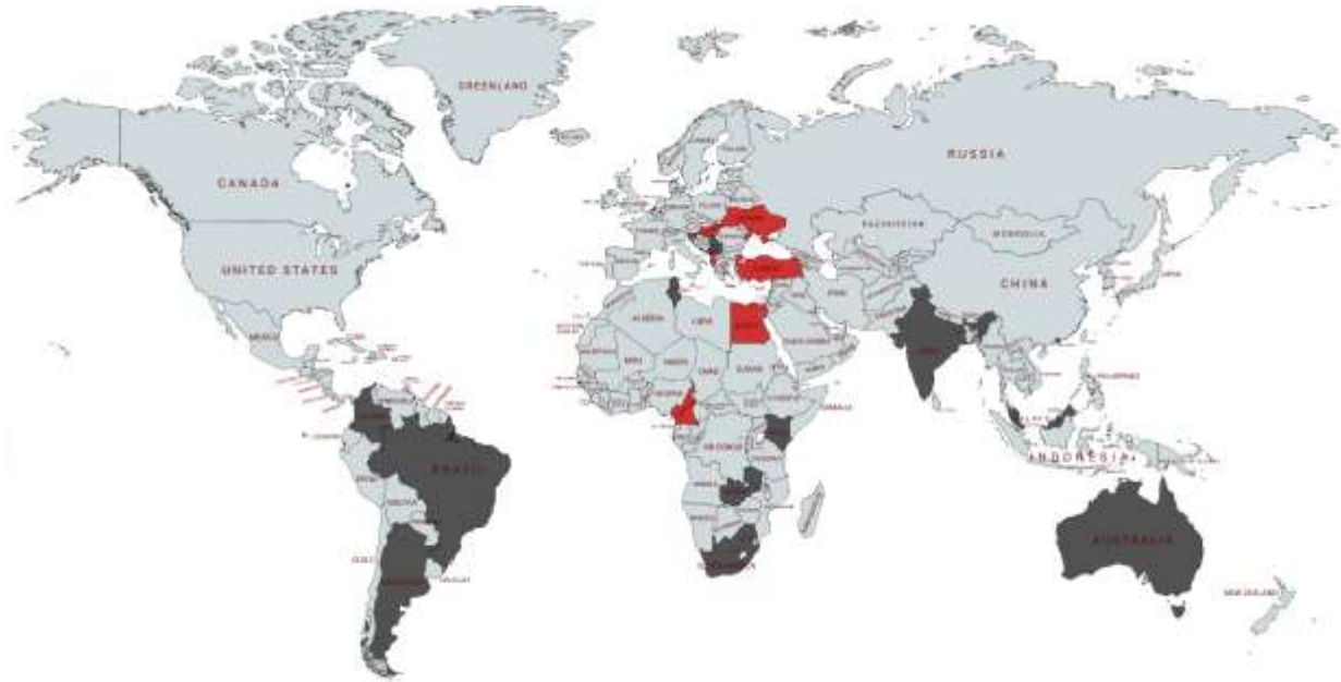
Figure 2. Countries responding to COVID-19 by increasing pensions temporarily (grey) and permanently (red) (May 8th, 2020)