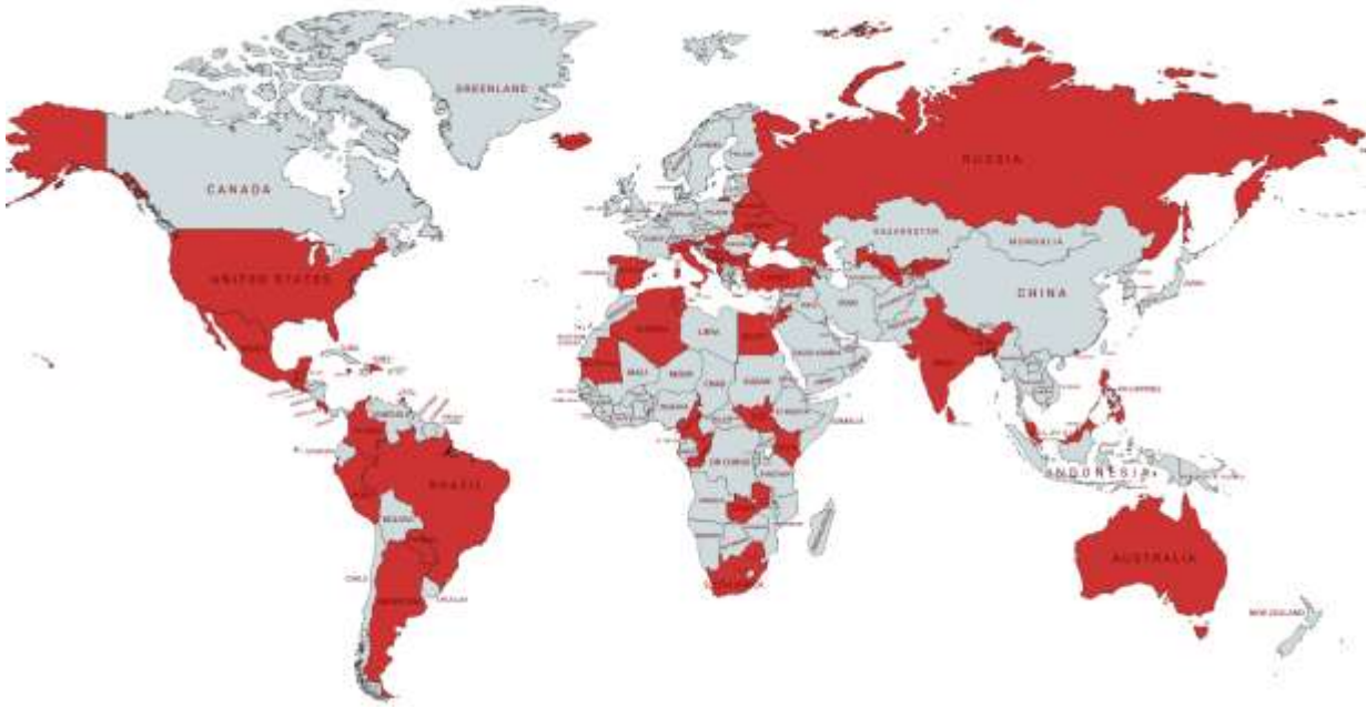
Figure 1. Countries responding to COVID-19 with social protection schemes specifically for older people (May 8th, 2020)